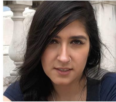
Nikita Gill, Poet

'I discovered that poetry is a place where you can be yourself and you can speak your truth.'